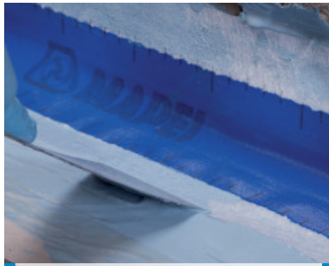
Application of Mapeband on a wall-floor fillet joint with Mapelastc AquaDefense