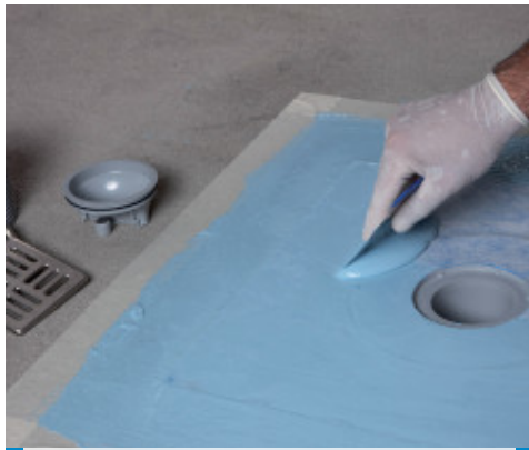
Impregnating Drain Vertical fabric with Mapelastc AquaDefense