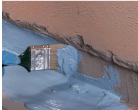
Application of Mapelastc AquaDefense by brush between floor and wall before applying Mapeband