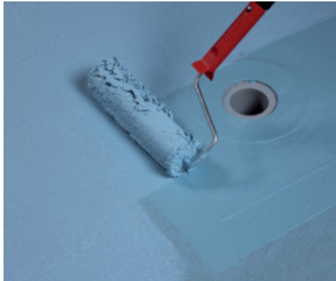
Application by roller of Mapelastc AquaDefense second coat