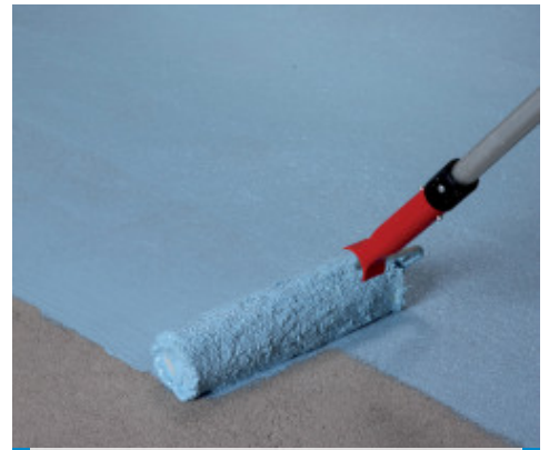
Application of the first coat of Mapelastc AquaDefense on a screed