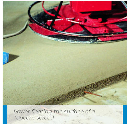
Power floating the surface of a Topcem screed