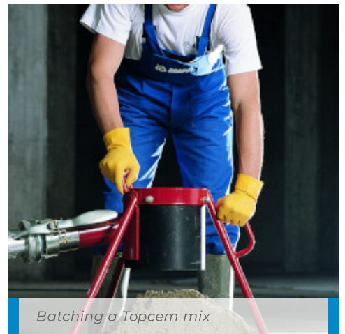
Batching a Topcem mix