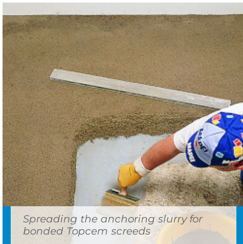
Spreading the anchoring slurry for bonded Topcem screeds