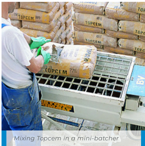
Mixing Topcem in a mini-batcher