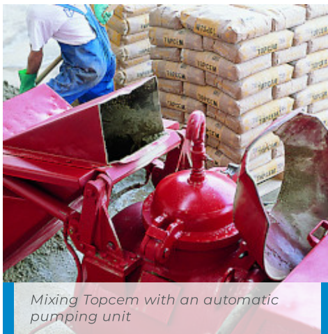
Mixing Topcem with an automatic pumping unit