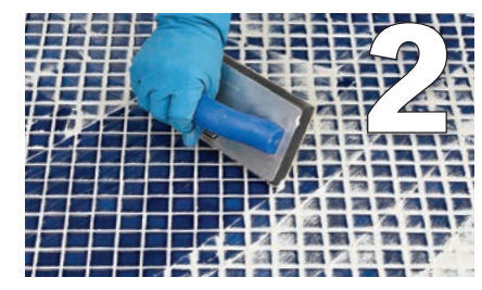
Remove excess ARDEX EG 8 PLUS from the surface