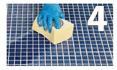
Clean down the tile surface to remove emulsified residues