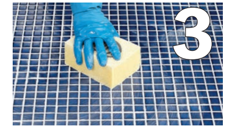
Wash off any residue when the grout is slightly hardened in the joints, in as little as 15 minutes and up to 60 minutes after application